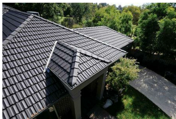
02: ROOF TILE