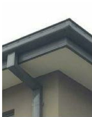
03: FASCIA & GUTTER