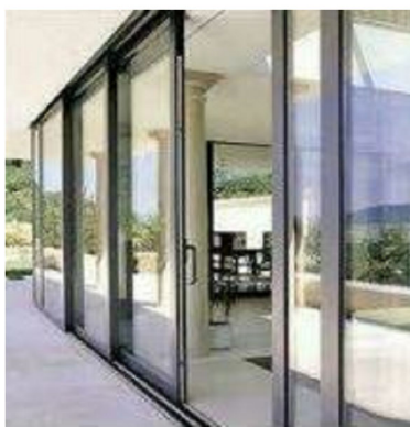
04: ALUMINUM WINDOWS & DOORS